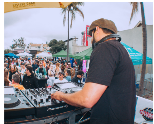
SUNDAY FUNDAY 3rd Sunday in April-June 12-6 p 1,000 Est. Attendance

TASTE OF HILLCREST April 13, 2024 12-4 p 1,200 Est. Attendance