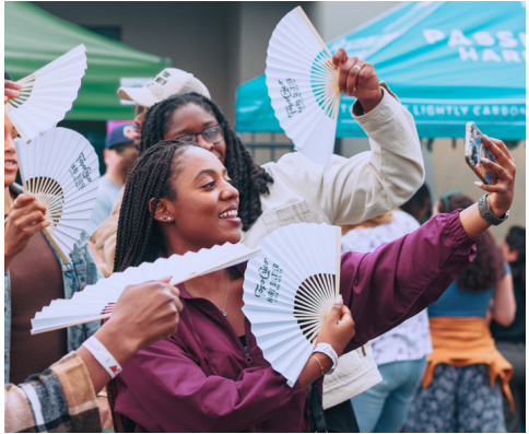
CUSTOM SPONSORSHIPS Custom sponsorships available upon request!

SHOP HILLCREST Small Business Saturday -December 26th 5,000 Est. Attendance